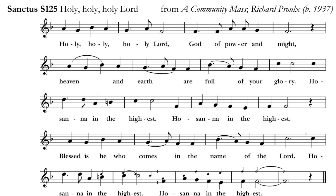
The people stand or kneel.

Therefore we praise you, joining our voices with Angels and Archangels and with all the company of heaven, who for ever sing this hymn to proclaim the glory of your Name: