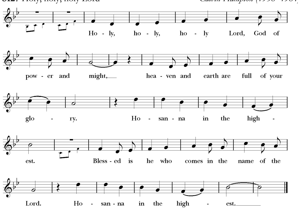
The people stand or kneel.