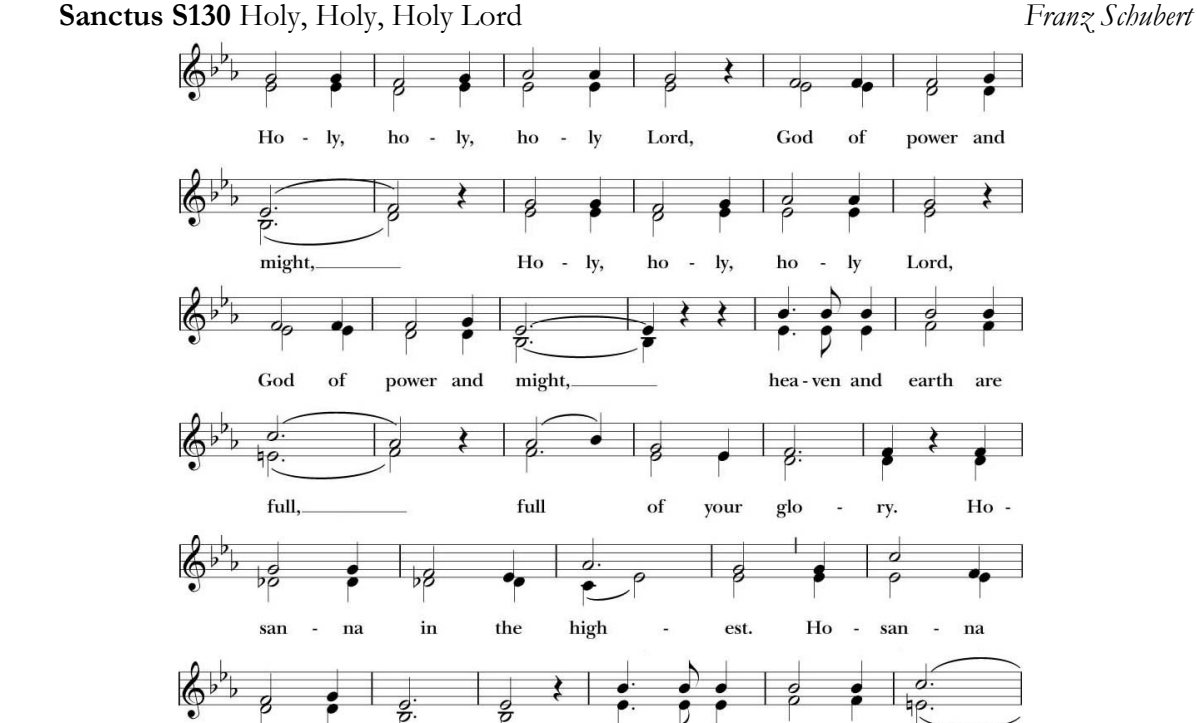
The people stand or kneel.

Therefore we praise you, joining our voices with Angels and Archangels and with all the company of heaven, who for ever sing this hymn to proclaim the glory of your Name: