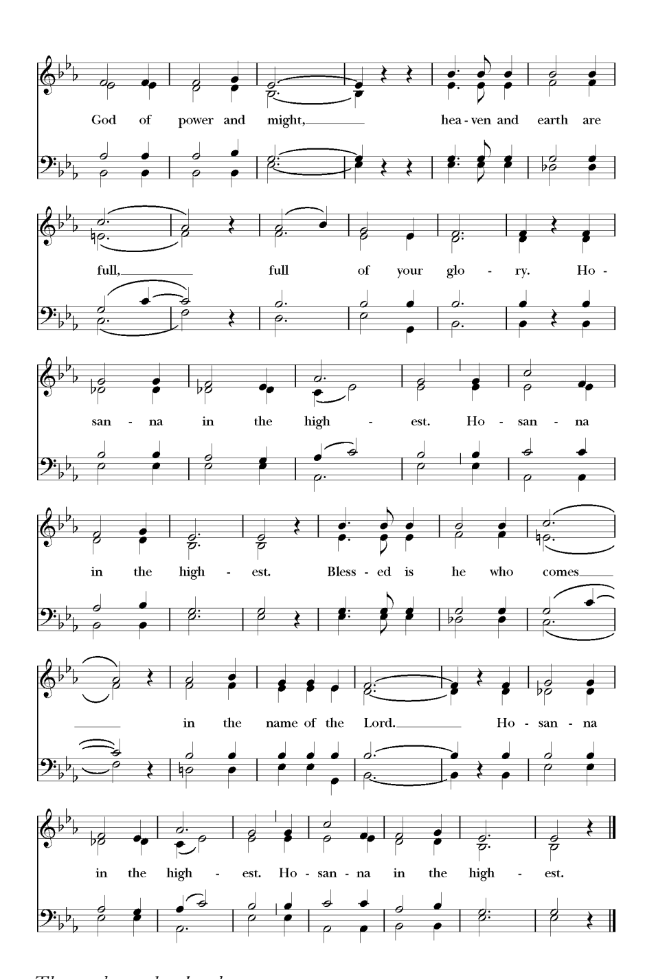
The people stand or kneel.